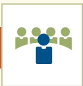
Participation in group therapy