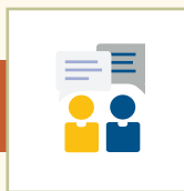
Weekday Individualized Support